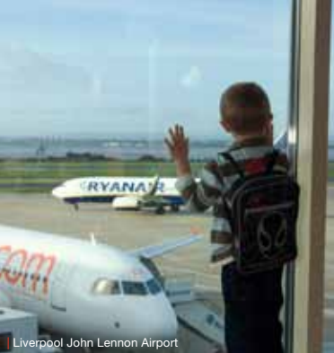
Liverpool John Lennon Airport