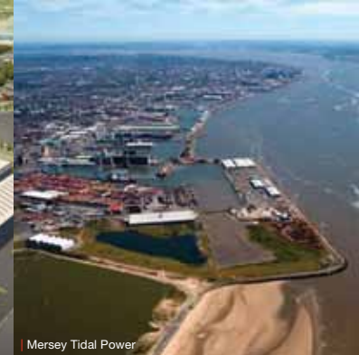
Mersey Tidal Power