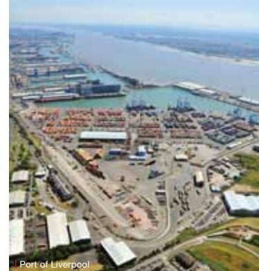
Port of Liverpool