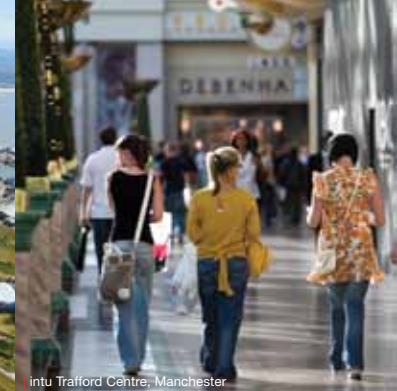
Intu Trafford Centre, Manchester