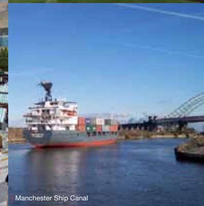
Manchester Ship Canal