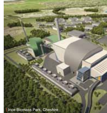
Ince Biomass Park, Cheshire