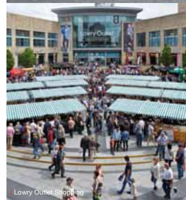
Lowry Outlet Shopping