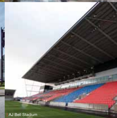
AJ Bell Stadium