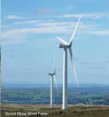
Scout Moor Wind Farm